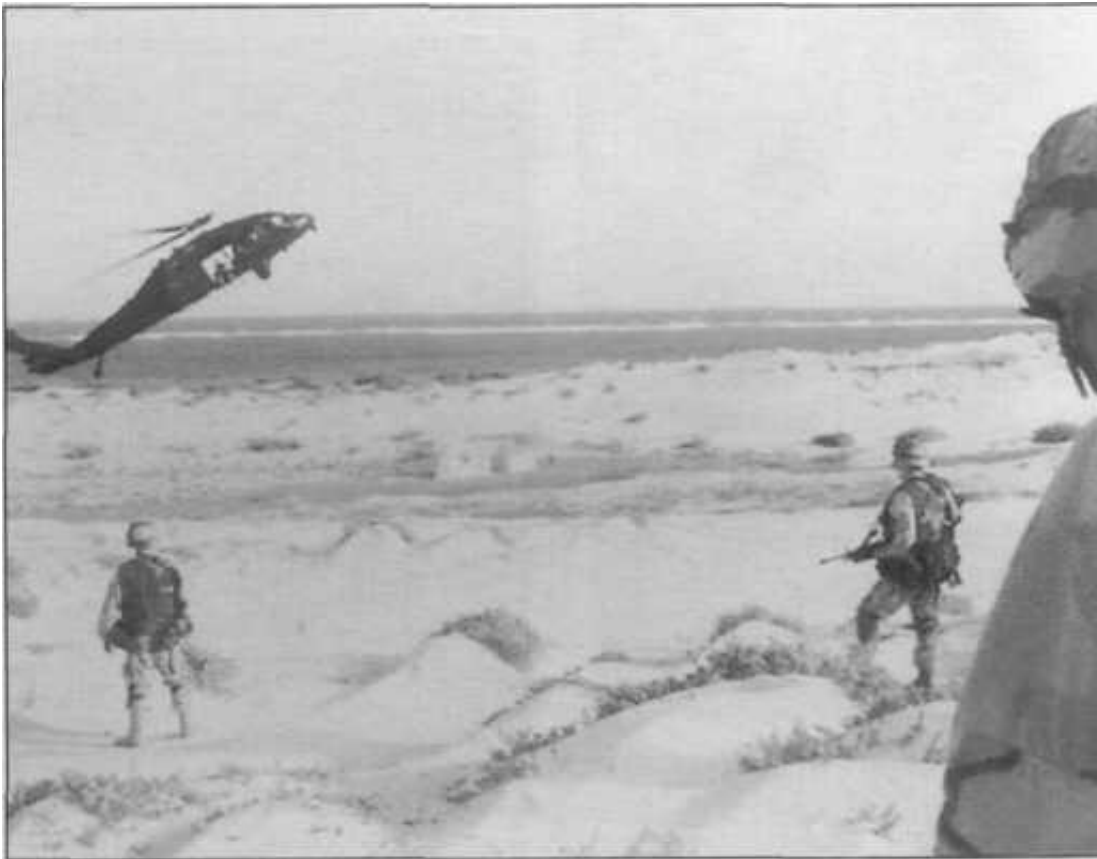
A Black Hawk flares before landing on one of the many practice missions in Mogadishu's dunes. Dale Sizemore.