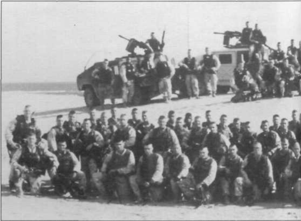
Group shot of Task Force Ranger without Delta Force. Humvees are in rear. David Diemer.