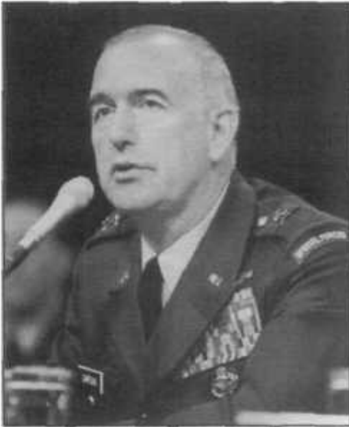
Maj. Gen. William F. Garrison, commander of Task Force Ranger, as he testified before the U.S. Senate committee in 1994.