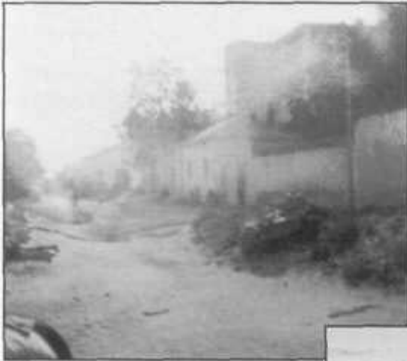
The only photograph taken from the ground during the battle on October 3. It was snapped looking west from Chalk One's position at the southeast corner of the target block. Target building looms in the background to the right. Jim Lechner.