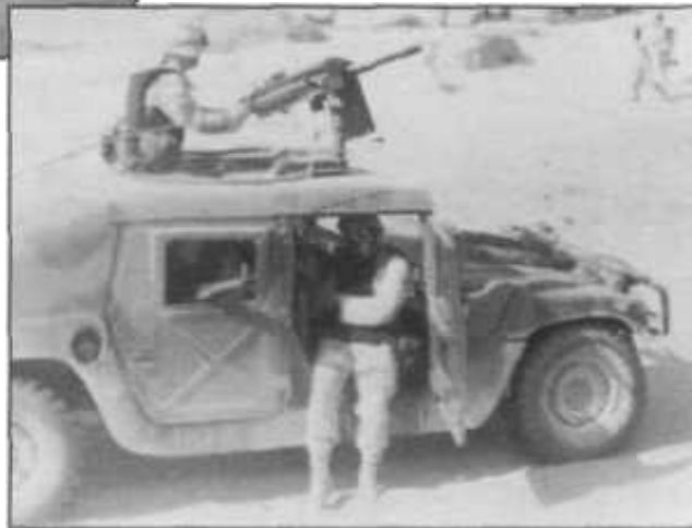
Rangers pose in a Humvee topped with a Mark-19. Clay Othic.