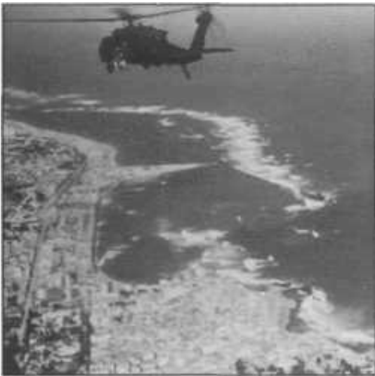
Black Hawk Super Six Four , piloted by CWO Mike Durant, moves in from the ocean over Mogadishu.