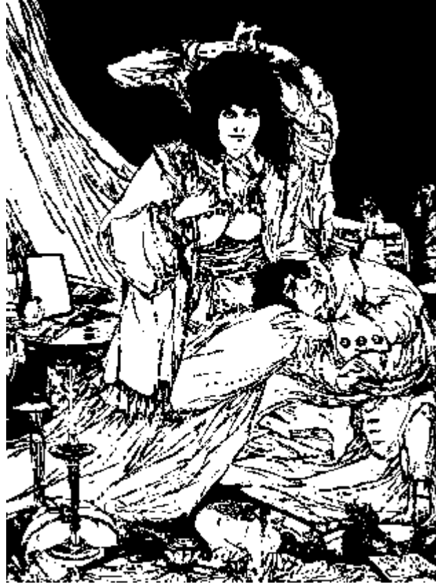
THE BEAUTY DOCTOR.